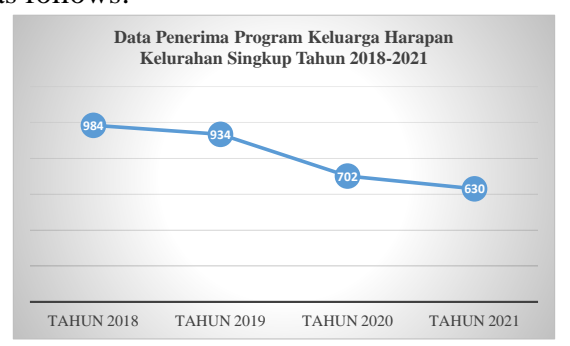
Figure 2. Livelihood Data of Singkup Village Residents

The description above is a condition where people's livelihoods affect the condition of community welfare. Therefore, from the declining level of community capacity for basic needs, it requires support from the government through the Family Hope Program which targets Very Poor Households. The following is data regarding the number of beneficiaries of the Family Hope Program in Singkup Village from 2018-2021, namely as follows: