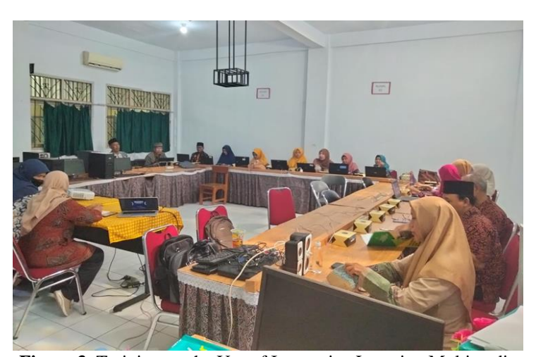
Figure 3. Training on the Use of Interactive Learning Multimedia

The level of achievement of program targets in community service activities carried out by the Researcher team of the Arabic Language Education Department is the availability of a training venue for Utilizing Interactive Learning Multimedia for Arabic Language Teachers of Madrasah Tsanawiyah ( MTs ) in Cirebon City at MTs Salafiyah and participants totaling 19 teachers consisting of teachers from MTs Salafiyah as many as 13 teachers and MTs Negeri 2 as many as 6 teachers. This community service activity was not only attended by Arabic language subject teachers but teachers of other subjects such as science, history of Islamic culture, English, etc.