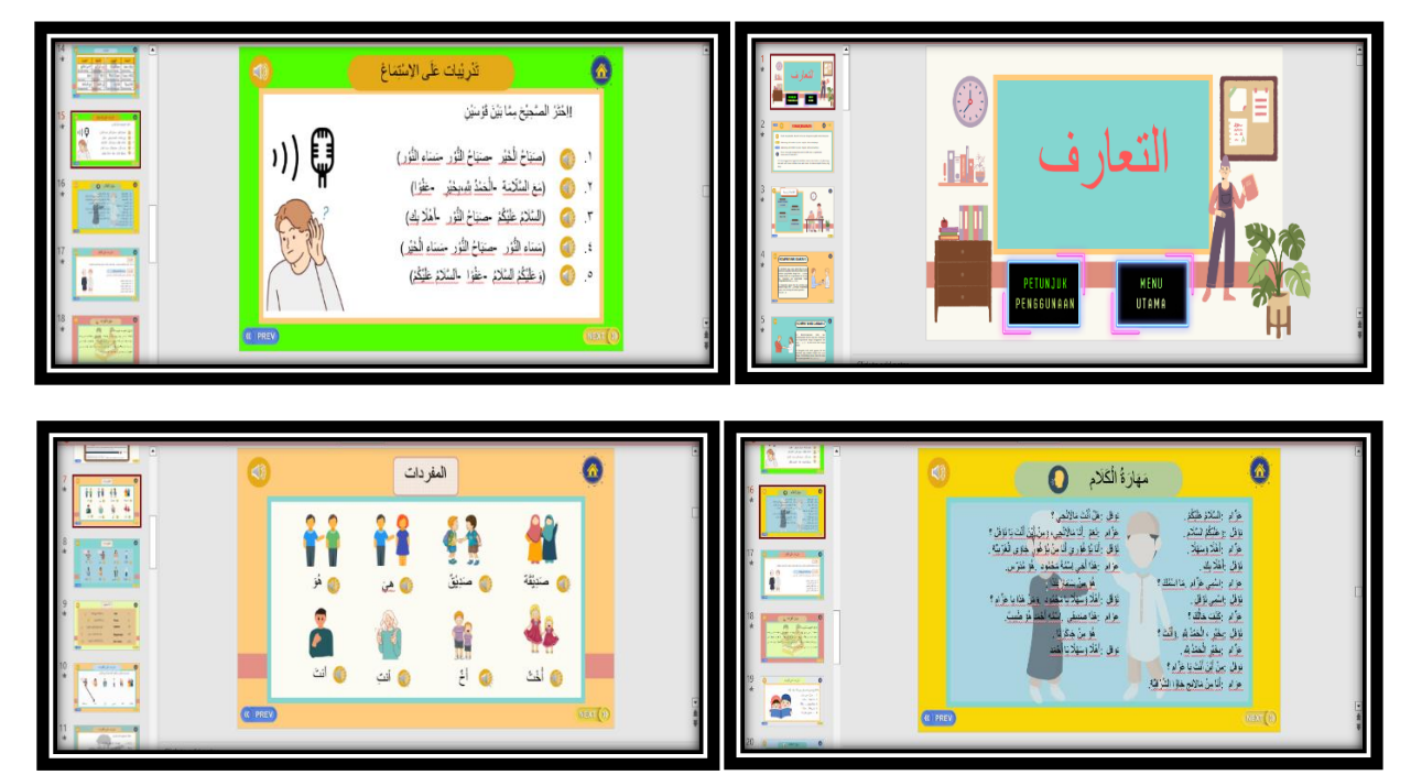
Figure 4. Audio visual teaching material products using PowerPoint

Show, Canva, and Quiziz were compiled based on the service and training modules produced by participants. The following audio-visual teaching material products were the results of the service: